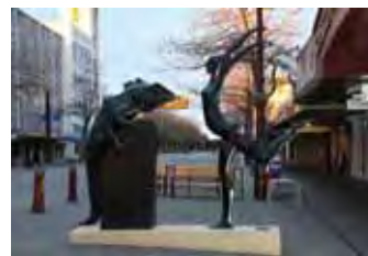
32 WHO'S AFRAID Paul Dibble, 2011 OUTSIDE THE REGENT THEATRE, 63 BROADWAY AVENUE

Commissioned by the Palmerston North City Council, the pukeko standing atop the columns are made of bronze. The raupo (a wetland plant also known as bullrush) is made from hand-hammered steel. In awarding the commission, the Council's landscape architects consciously rejected traditional Victorian, Edwardian and art deco images, in favour of a unique design reflecting Palmerston North's history.