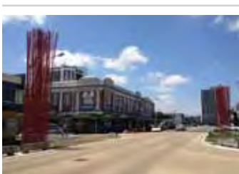
26 GIANTS AMONGST US Konstantin (Kon) Dimopoulos, 2012 INTERSECTIONS OF GEORGE & CUBA / CUBA & TAONU I STREETS

the size of a whale as equal to the height of 10 elephants. On one side, the whale rises on its tail from an atrium pond, while on the other side the elephants are stacked on top of each other. These two endangered species together support a lintel, on which rests an oversized arm holding a plumb-bob. The work is a comment by Dibble on the power mankind has over nature; the future of the world's largest land and sea mammals lies in our hands. In this way, the work combines notions of protection, preciousness and the precarious balance of nature.