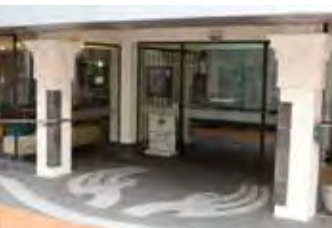
24 CITY LIBRARY 4 THE SQUARE (AT TOP OF GEORGE STREET STEPS)